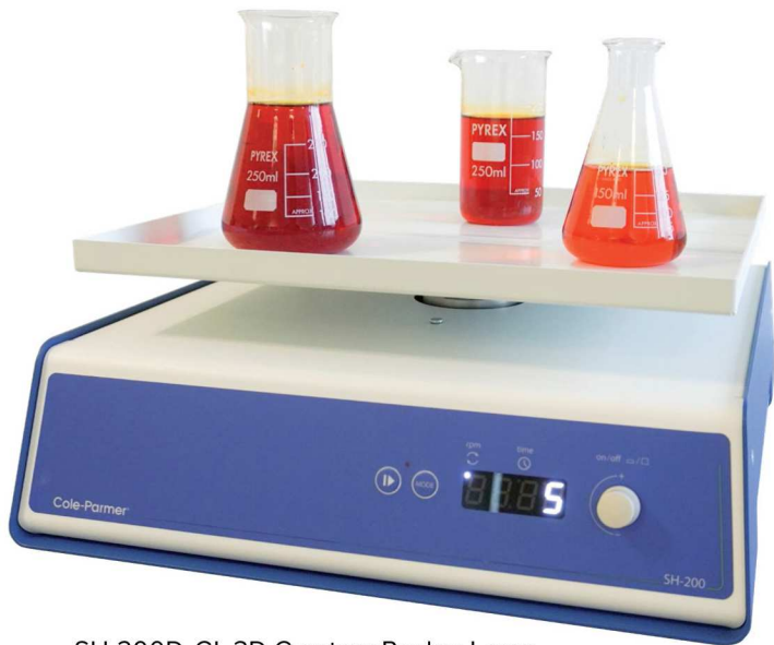
SH-200D-GL 3D Gyrotory Rocker Large